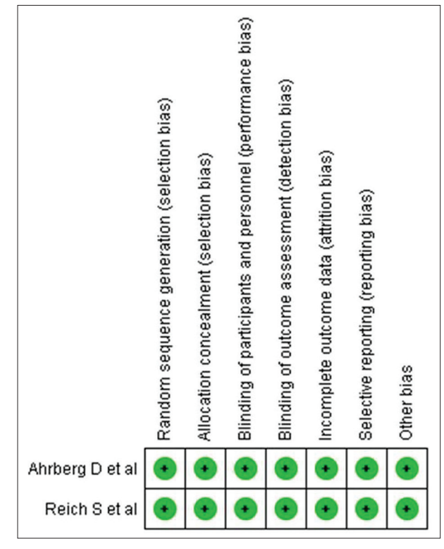
Figure 2: Risk-of-bias assessment

NR: Not reported, CAD: Computer-aided design, CAM: Computer-aided manufacturing, FDP: Fixed dental prosthes, C.O.S: Chairside oral scanner